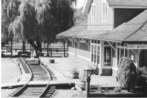
The development of community and tourist attractions based on a heritage theme can provide direct economic benefits.