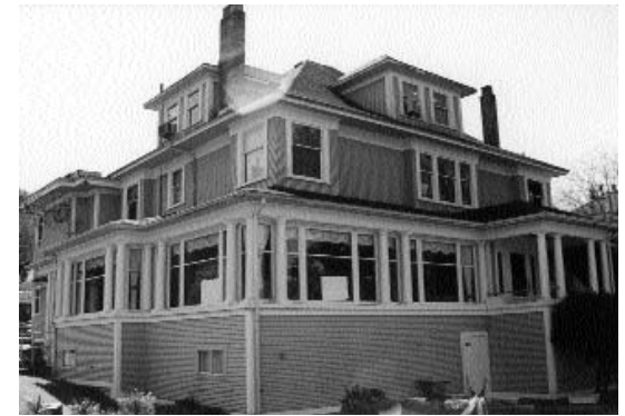
Former Perry Roe Residence -2227 St. Johns Street, one of the City's designated Heritage Buildings.

In order to assist in this conservation, Council has endorsed the development of a Natural Heritage Inventory for the City.